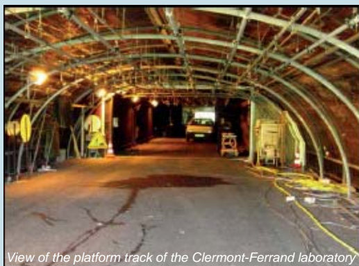
View of the platform track of the Clermont-Ferrand laboratory